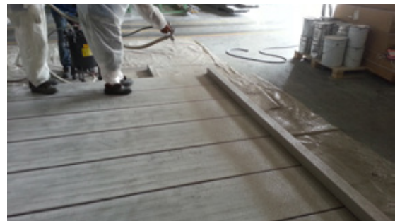
SIGMASHIELD™ 1090 being sprayed