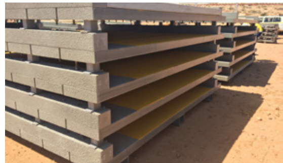
Completed panels waiting for installation at Cape Cuvier

PPG's PSX 700/SIGMASHIELD 1090 system will provide extended color and gloss retention, superior chemical and abrasion resistance along with excellent easy-to-clean, anti-slip properties. The system will provide the most resilient protection for the jetty and will also extend its service life to meet Dampier Salt's expectation.