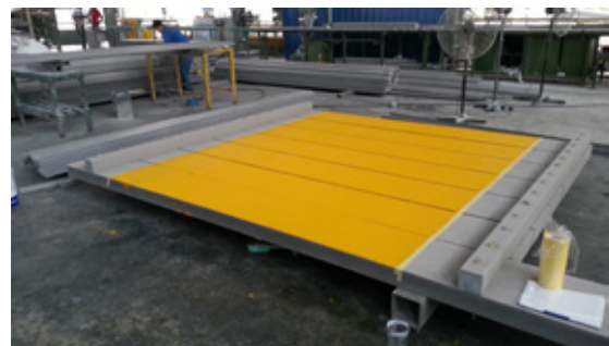
PSX® 700 Safety Yellow drive line

Contact us: Asia Pacific ☎ +86-21-6025-2688 ✉ ppgpmc.ap@ppg.com | Europe, Middle East and Africa ☎ +32-3-3606-311 ✉ customers@ppg.com Latin America ☎ +57-1-8764242 ext. 201 ✉ ppgpmcandean-ca@ppg.com | North America (US & Canada) ☎ +1-888-9PPGPMC ✉ PMCMarketing@ppg.com | ppgpmc.com PM16171 | Created February 2016